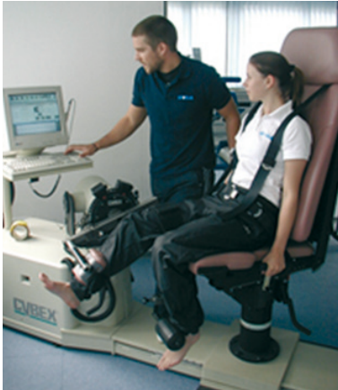
Analysis of the body