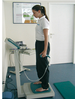
Body Composition Analyser Inbody 3.0 Biospace