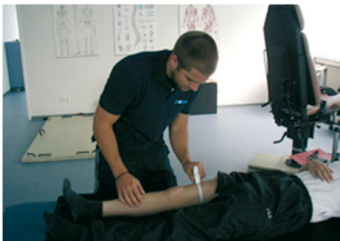
Approach to measurement